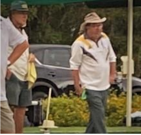
What could they be doing?