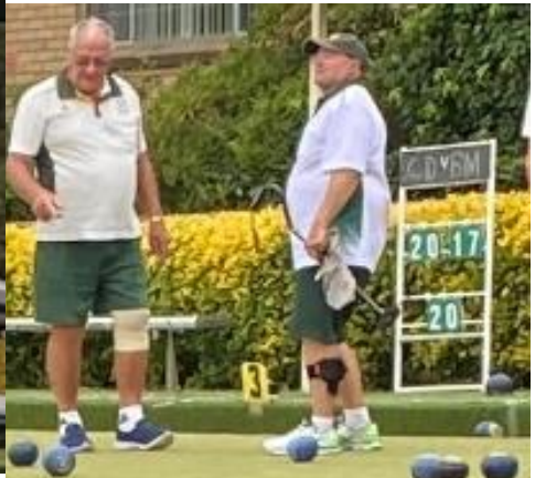
Mine beats yours – no 2 to you!